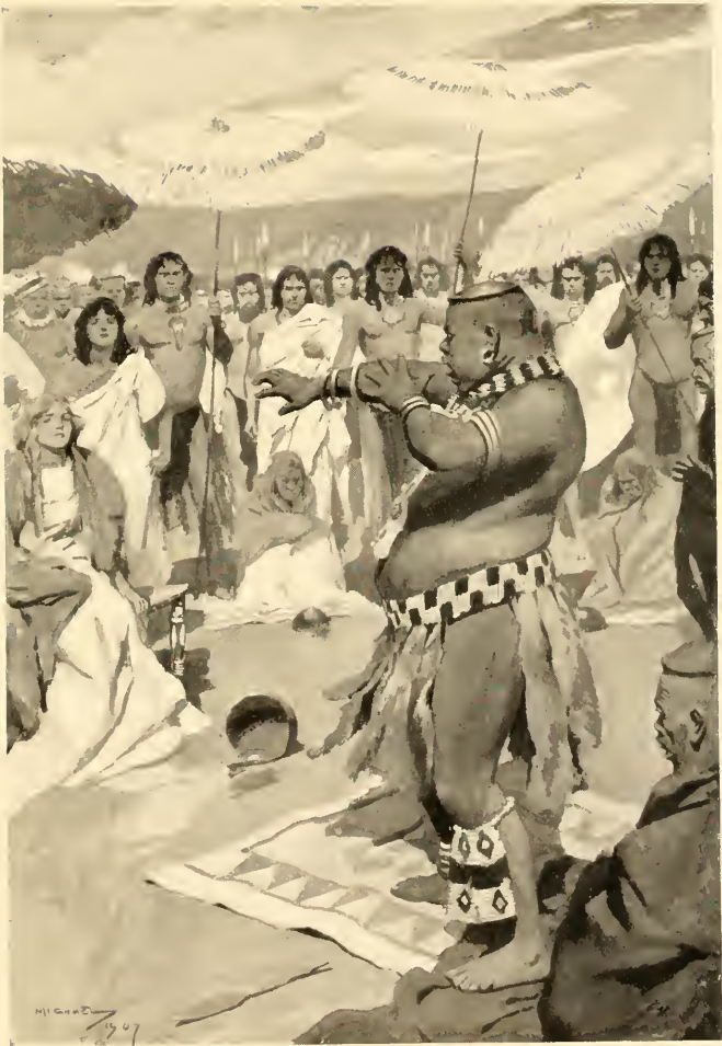
“ DINGAAN leapt up in his rage and terror ” (see page 273).